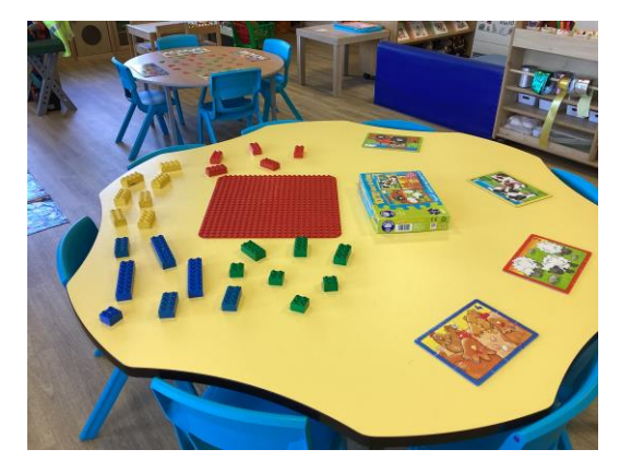
Interactive board for activities