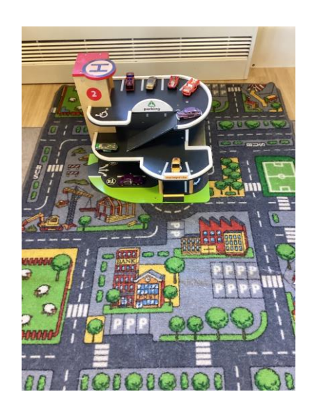
Car mat and garage