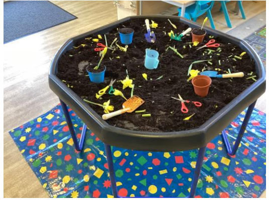
Tables for games and activities